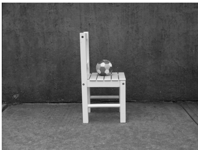
Fig. 15. B&C 3–6.