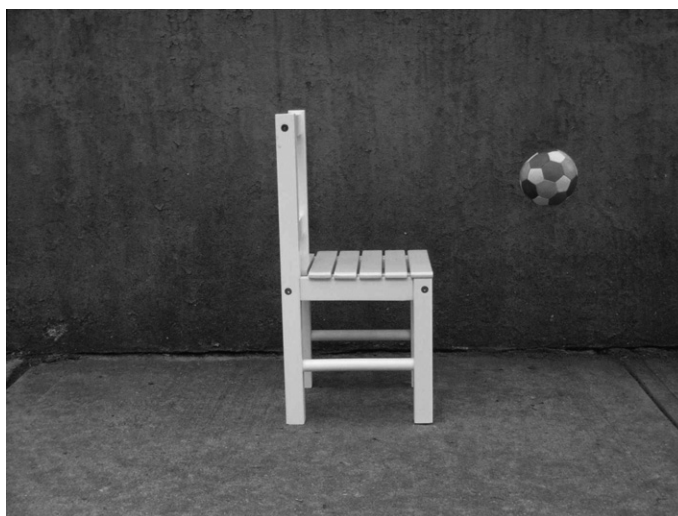
Fig. 17. B&amp;C 4–10.