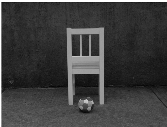
Fig. 13. B&C 1–7.