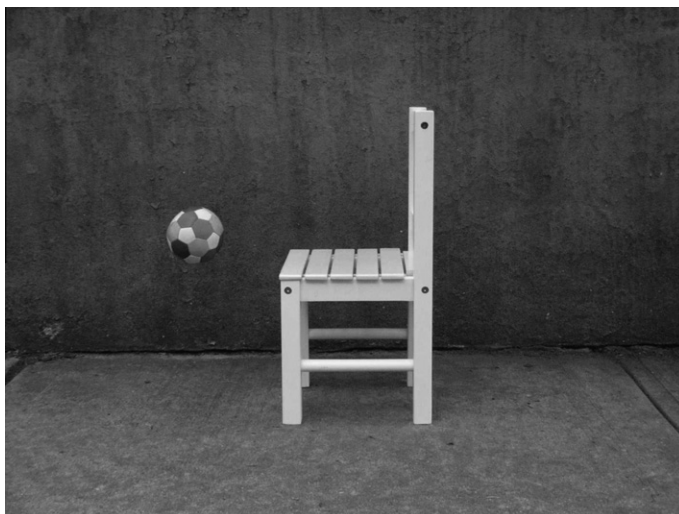
Fig. 4. B&C 4–9.