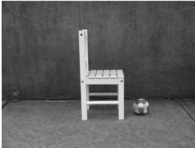
Fig. 7. B&amp;C 2–10.

Note that the utterance in (8) also contains information regarding the orientation of the chair, namely with the verb phrase Hehe iti iquicolim quij Socaaix iicp hac, Hezitim quih iicp hac iiqui tiizc... 'The chair is facing Punta Chueca and the city...', which involves a landmark-based FoR. In Seri, as is discussed in Section 5.2, speakers frequently used different strategies for describing the orientation of the chair as opposed to the location of the ball in the B&C task.