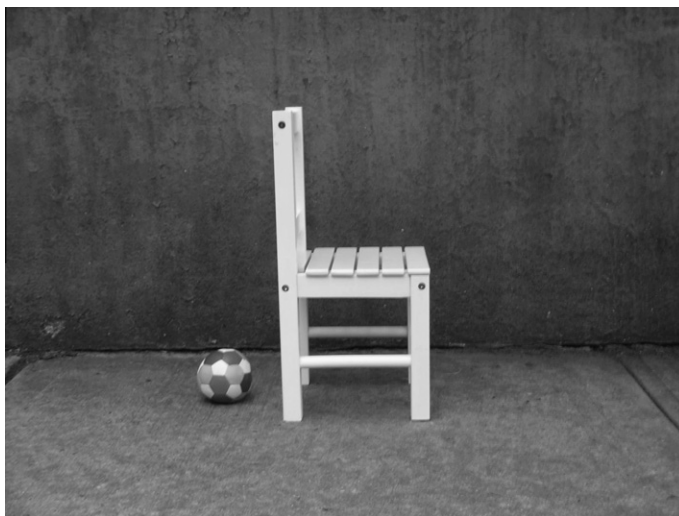
Fig. 2. B&C 3–11.