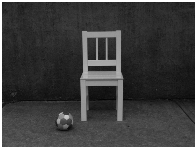
Fig. 12. B&C 3–3.

In addition to using direct FoRs in describing the orientation of the chair in the B&C task, Seri speakers regularly used landmark-based FoRs. Propositions involving the orientation of the chair involving landmark-based FoRs were the next most frequent after direct FoRs consisting of 14% (and tied with relative FoRs in terms of frequency), as was shown in Table 6. This is illustrated in the description in (19) where the speaker indicates that the chair is facing the direction of the desert. In the description provided in (20), the speaker indicates that the chair is facing the direction of Socaaix 'Punta Chueca'. These types of descriptions involve vectors that extend from the front of the chair toward the direction of the landmark that serves as the anchor of the coordinate system and the ground in the description. For more types of landmarks that are used in Seri within this context, see Table 5.