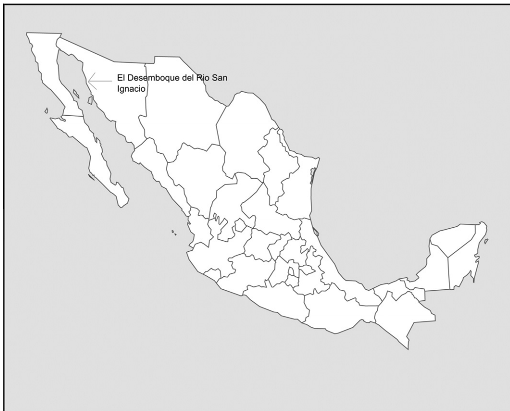
Map 1. El Desemboque (del Rio San Ignacio), Sonora, Mexico.

Example (2) illustrates that the preferred order of constituents in locative descriptions in Seri is the noun phrase that refers to the figure, ziix ano icoosi quih 'the cup', followed by the noun phrase that refers to the ground, hehe iti icoohitim com 'the table', and then the verbal expression.