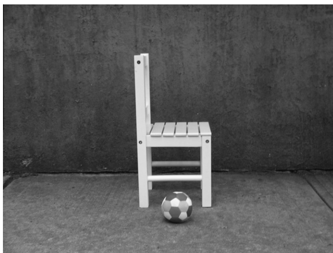
Fig. 11. B&amp;C 3–10.

In describing the location of the ball with respect to the chair, Seri speakers also provided utterances that involved a direct FoR. However, instances of propositions involving direct FoRs in this context were limited to around 3% of the total responses regarding the location of the ball with respect to the chair. As a reminder, a direct FoR involves a coordinate system that is anchored to an observer's body, but is not projected from it onto a distinct ground. In (16) the ball is described as being on 'my side', the side of the chair that is closest to the speaker.