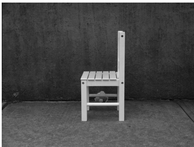
Fig. 16. B&C 1–3.

At times the use of a relative FoR caused confusion for Seri speakers trying to complete the B&C task. It is not entirely clear if this had more to do with the fact that some Seri speakers are less comfortable using the terms -sliic 'left' and -nol aapa 'right' or if there is just general confusion regarding the interpretation of such terms under a relative FoR as opposed to an object-centered FoR. Perhaps there is influence from Spanish, speakers of which frequently use the terms izquierda 'left' and derecha 'right' within a relative FoR. Nevertheless, these terms caused misunderstanding and at times frustration between some of the pairs of Seri speakers who completed the B&C task.