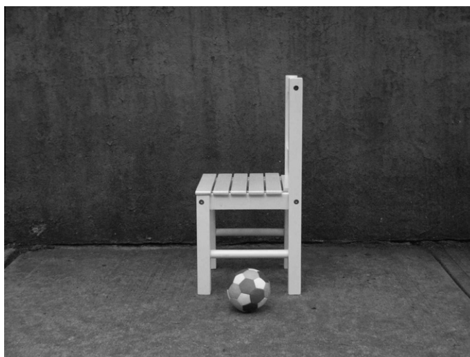
Fig. 10. B&amp;C 3–9.