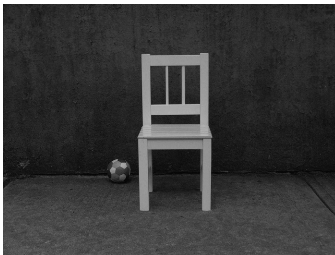
Fig. 8. B&amp;C 4–11.