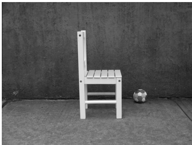
Fig. 3. B&C 4–8.